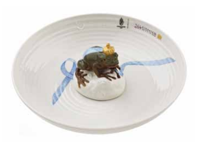
Hella Jongerius, Animal Bowl with frog

Dutch designer Hella Jongerius immersed herself in the archives of the German porcelain manufactory Nymphenberg to come up with plates which combine hand-painted patterns and little sculptured animals, all done in 18th century style.